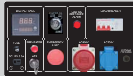
Three Phase LED5