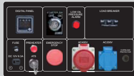
Three Phase LED3